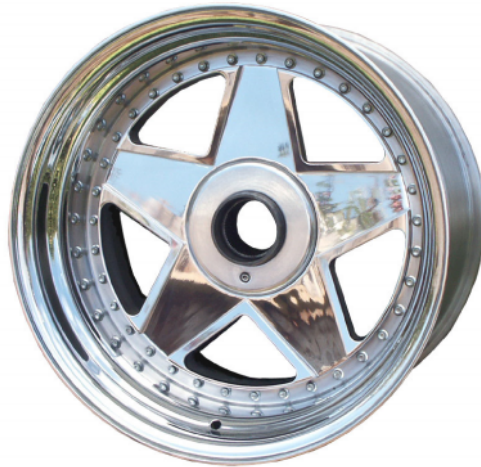
RR365-17 polished center

The wheel choice for Ferrari spline drive applications has historically been limited with some suppliers having long lead times and spotty delivery dates. Other manufacturers only offer “modern” designs that just don’t look right on Pininfarina classic body designs.